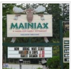
Mainiax Restaurant, Wells, Maine

"Hey, Rocky, watch me pull a great Maine dining value out of my hat!"